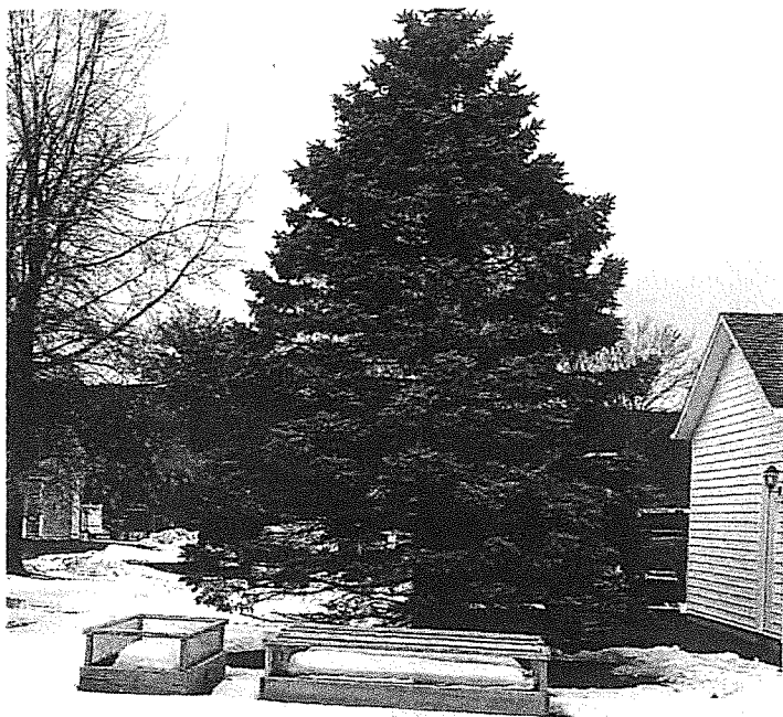
Looking North from -behind parking spot. ↑