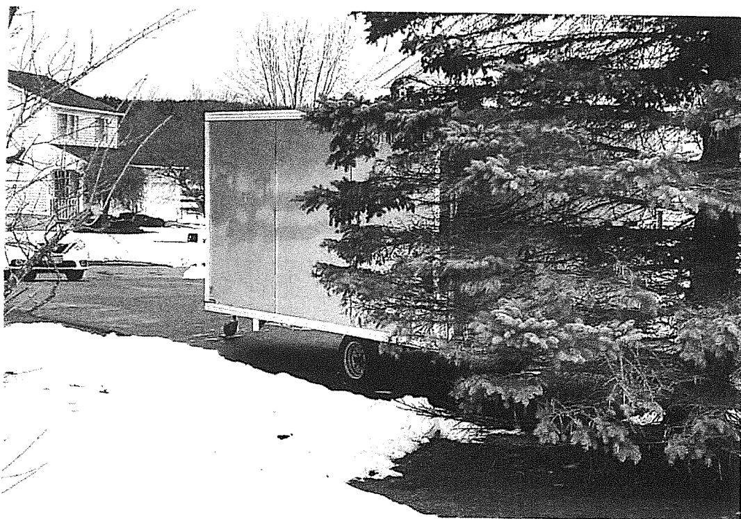
Looking North East from property line @ closest neighbor ↑