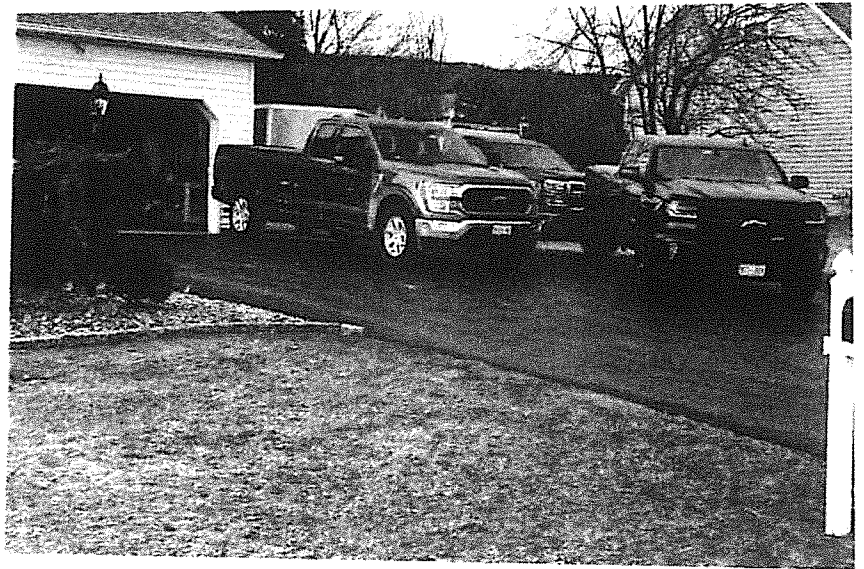
Looking South west from Sanford Place ↖