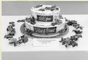
Village Celebrated 125 years in 2015