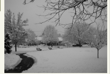
Orsini Park in the winter

to allow for proper plowing. Please be considerate, and thank you for your compliance. Your cooperation will allow for easier snow removal and safer streets for all of us.