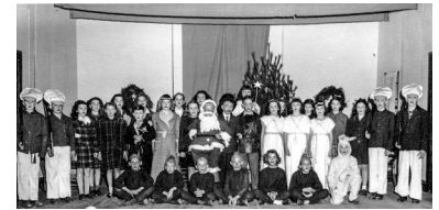
AHS Production of "Red Candles" A 1946 Operetta in Two Acts

Residents may contact the Albany County Board of Elections at 487-5060 to verify their current registration status at any time.