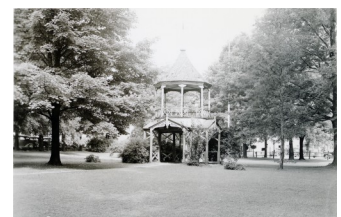
Double Tier Gazebo - Orsini Park