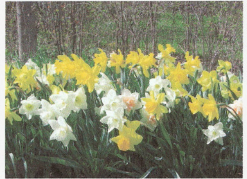
Maple Avenue Park Daffodils