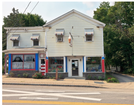
Home Front Cafe

SEFCU; Altamont Community Tradition (ACT); Home Front Café; Sundown Lawn and Landscaping; Private Donors