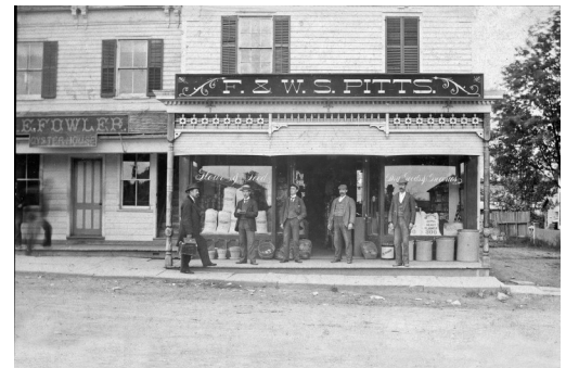
F & W.S. Pitts Grocery Store