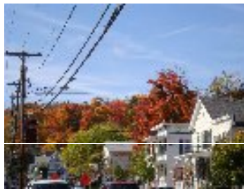
Main Street Fall 2009

Yard Waste collection begins on October 5 and runs through November 26. The Village will vacuum leaves on Tuesdays and Fridays, weather permitting. If using bags, they must be biodegradable, closed and sealed. Brush and branches, no longer than 2" diameter, must be bundled with twine, a maximum of 4 feet in length, and must be able to be lifted to the truck by one man. These items will be collected on Wednesdays.