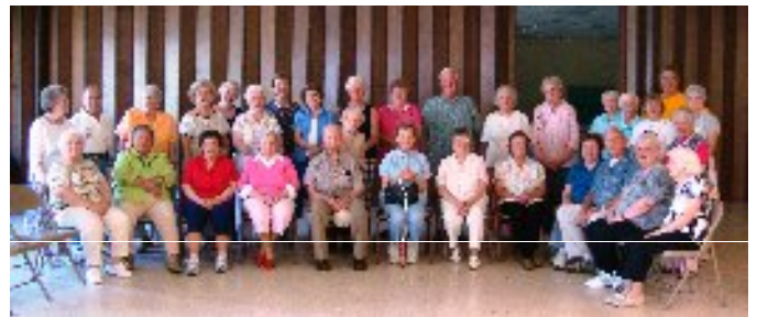
Altamont Seniors September 2010

On November 17, the Seniors will travel to the Garden Hilton in Troy for a holiday luncheon and Christmas show.