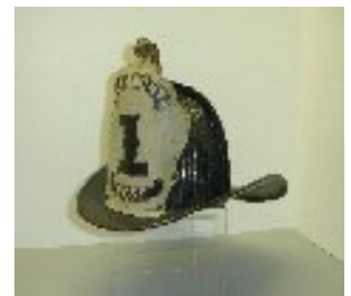
Altamont Hose Company Helmet